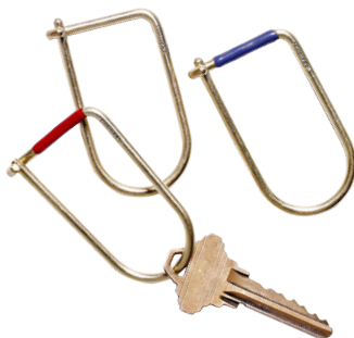
Craighill's brass rings, accented with color, will distinguish everyone's house key (and instantly bond your brood). Wilson key rings, $15 each, craighill.co.