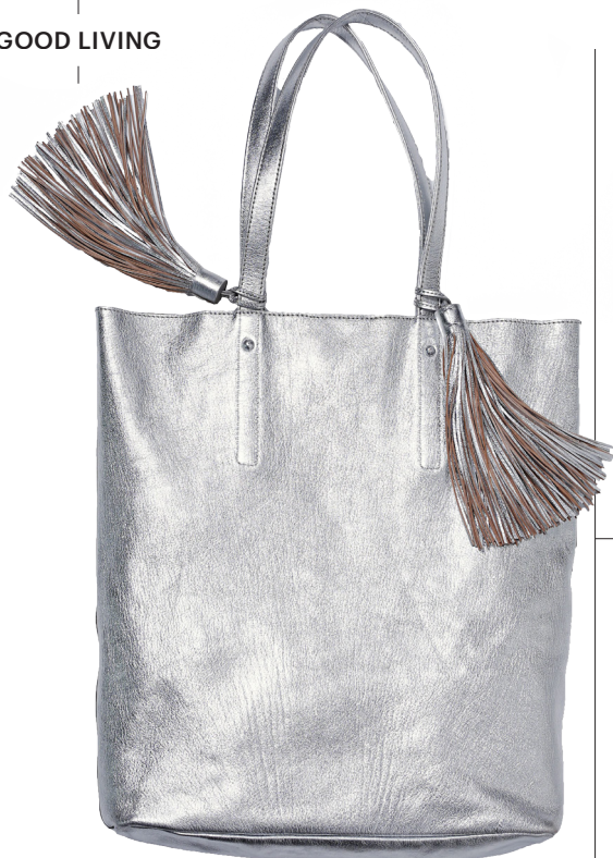
Roomy enough for a laptop, Loeffler Randall's tasseled metallic leather tote is bound to be someone's new everything bag. Cruise tote, $395, bloomingdales.com.