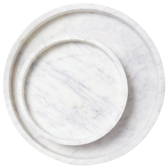
Maybe you can't give Mom marble counter-tops for Xmas. Couleur Nature's exquisite trays come in a very close second. From $50 each, couleurnature.com .