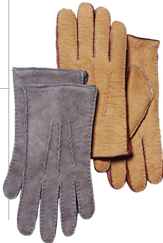
ILLUSTRATION BY ALEX ROKA; PHOTOGRAPHS BY PETER ARDITO (NECKLACE, CREAMS, BEAUTY BAR, HEADPHONES, FRAGRANCE, BALM), MARTYNA SZCZESNA (TOTE, PAJAMAS, SLIPPERS, KEY RING, GLOVES, BRASS BOX, SOCKS)