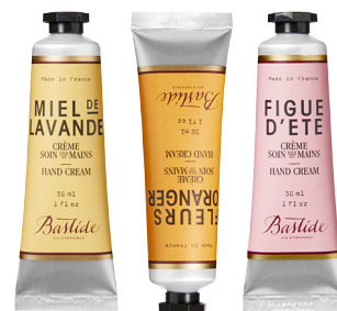
These rich hand creams from Bastide come in French-vacation scents like lavender, orange blossom, and fig. $12 each, bastide.com.