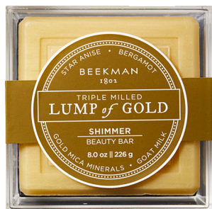
She's been very good, so gift her the Beekman 1802 Lump of Gold shimmer beauty bar for supreme skin pampering. $15, shop.beekman1802.com.