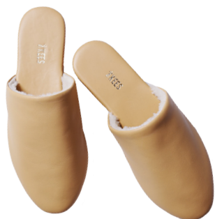
Tees faux-sheepskin slippers are sleek and supple on the outside, plush on the inside, and exquisite from every angle. Ines slides, $150, tees.com.