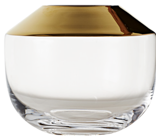
Gardeners need a place—and a vase—for their most prized blooms. Enter this metallic-trimmed stunner from LSA International . $50, lsa-international.com .