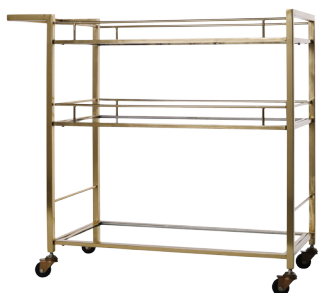
Stainless steel with a brushed-gold finish, Martha Stewart Collection's bar cart adds entertainment value to any space. $286, macys.com .