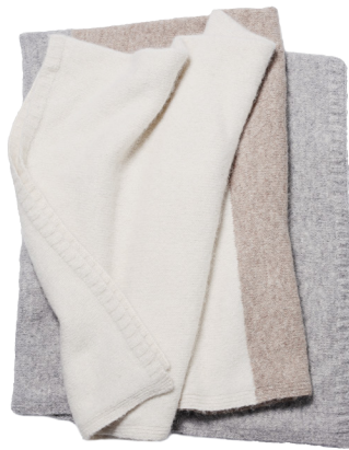
Send a virtual hug, in the form of a plush, buttery-soft color-blocked alpaca throw from designer Jenni Kayne's new home line. $350, jennikayne.com .