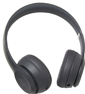
Beats by Dr. Dre wireless headphones boast a lightning-fast recharge—just five minutes gives you three hours of listening. Solo3, in Asphalt Gray, $300, apple.com.