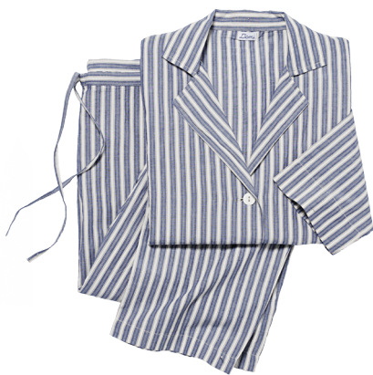
Domi's luxe organic-cotton pajamas beg to be lounged in past breakfast. $210, sleepdomi.com.