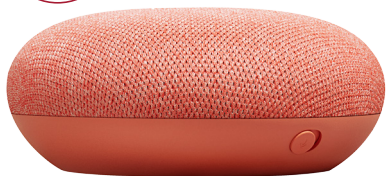
The Gen-Zers in your life will heart Google's Home Mini—the smaller, cuter version of its know-it-all digital assistant. $49, target.com .