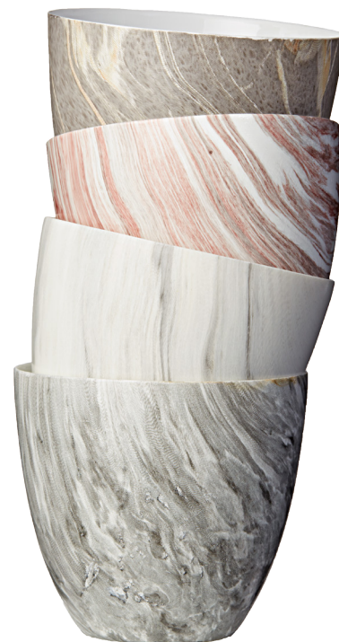
Give the gift of chic and neat. These Jayson Home porcelain cups beautifully corral odds and ends in every room. Quarry cups, $16 each, jaysonhome.com .