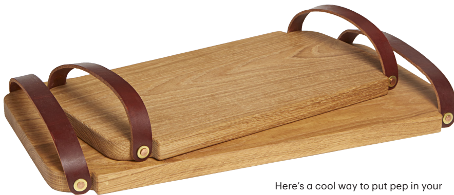
Here's a cool way to put pep in your host's serving step: Wrap up an oak tray with leather handles by Lostine . From $165, ahalife.com .