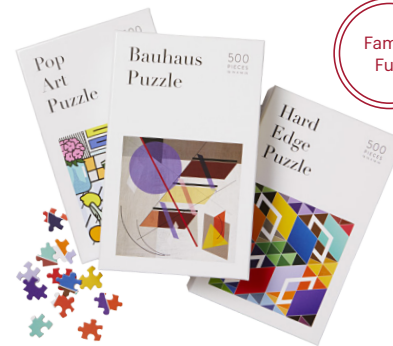
Set in motion a fun, screen-free evening at home with Dovetail's colorful, artsy puzzles. $60 for 3, food52.com .